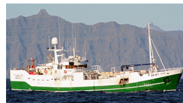
M/S Kristin GK-157