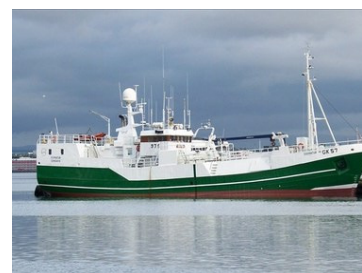
M/S Sighvatur GK-57