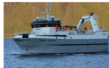
M/S Vörður EA-748