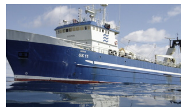
M/S Gnúður GK-11